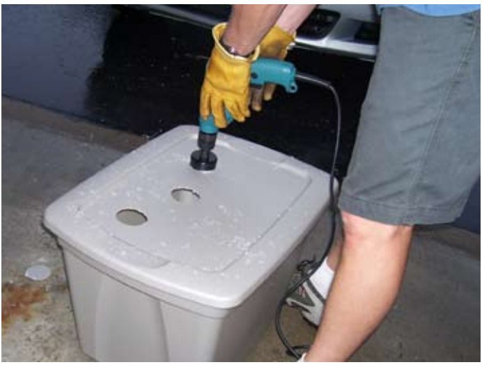
Cut holes in top of bin. You can use a drill, knife, or saw to do this. 4-6 holes about 2" in diameter will work for an 18-gallon bin. Smooth holes with sandpaper.