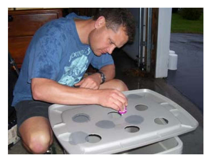
CONGRATULATIONS! You've made a worm bin! To use your bin, shred some newspaper to line the bottom. Add your worms (at least 1 pound), some food scraps (1/2 lb. per week to start), and cover with shredded newspaper.